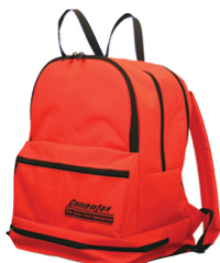
Optional Kit Backpack