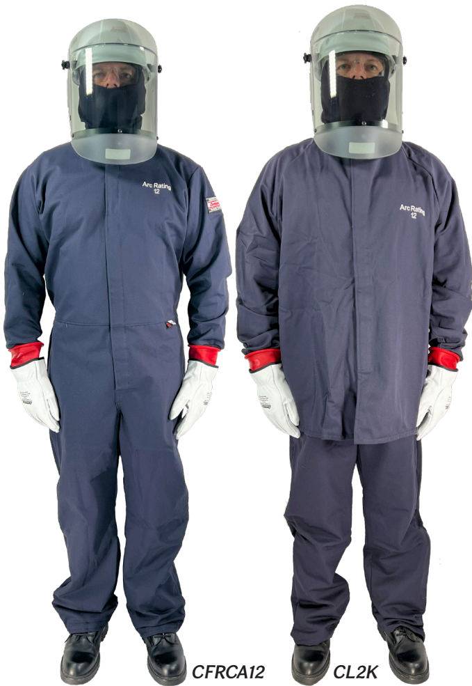
CFRCA12 CL2K *shown with class 0 glove option*