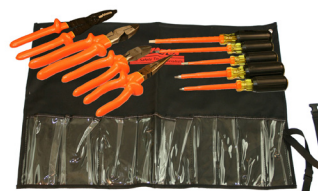
Optional Tool Kit (TR-9ELK)