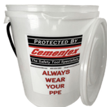
Optional Kit Storage Canister