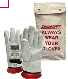
Optional Glove Kit *Class 0 shown*