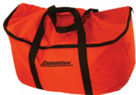
Standard Kit Duffel Bag