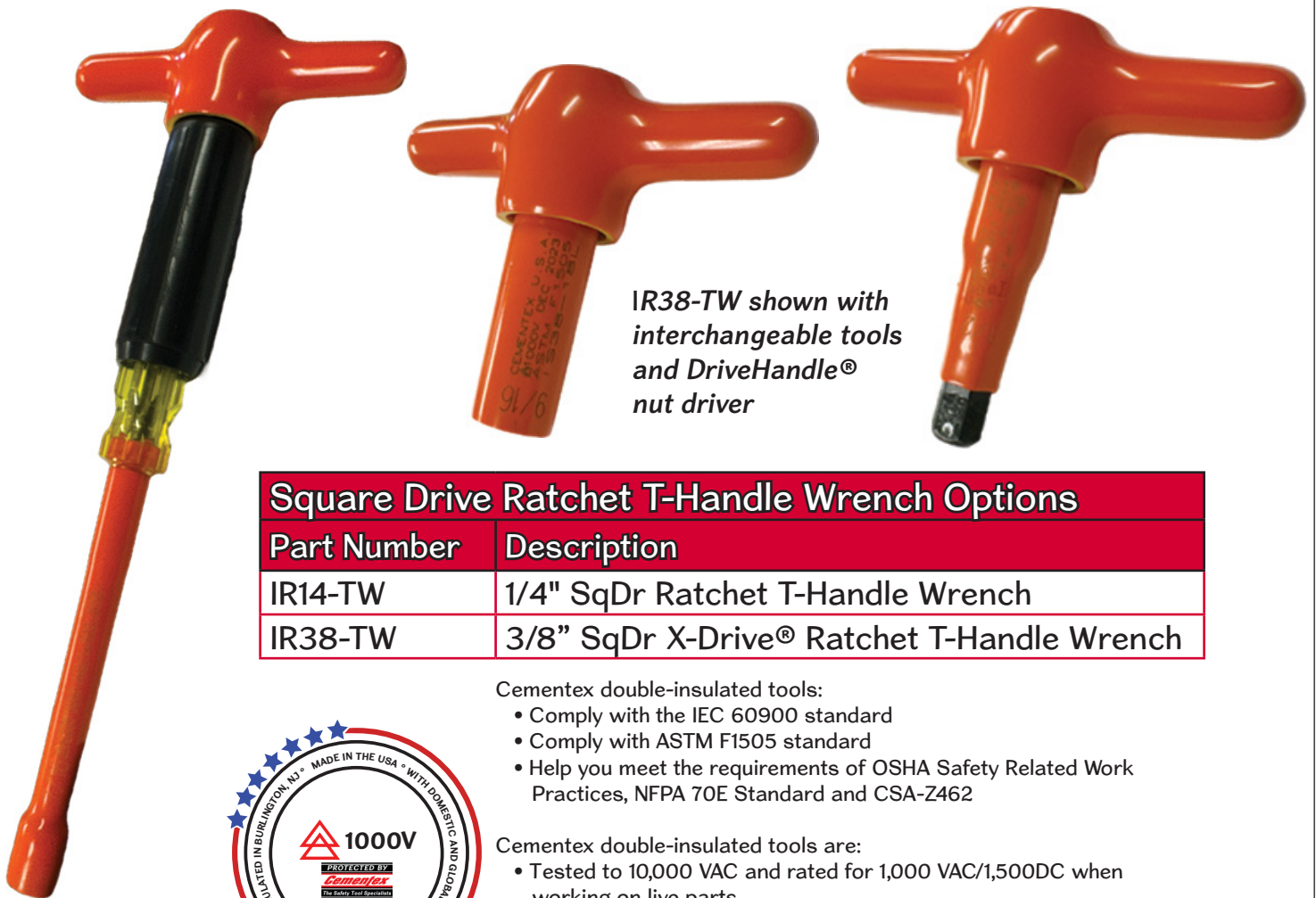
IR38-TW shown with interchangeable tools and DriveHandle® nut driver

The T-Handle Wrench Ratchet allows users to connect to extension bars, sockets, bit sockets and even DriveHandle® nut drivers to achieve desired tool configuration to significantly expand the functionality of your existing tools.