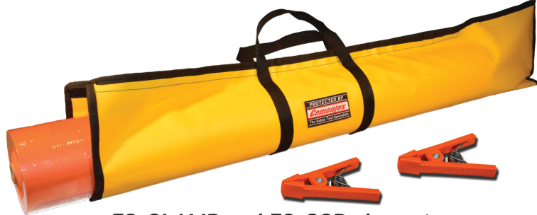
ES-CLAMP and ES-CSB shown in representation of ESO-7.5K kit