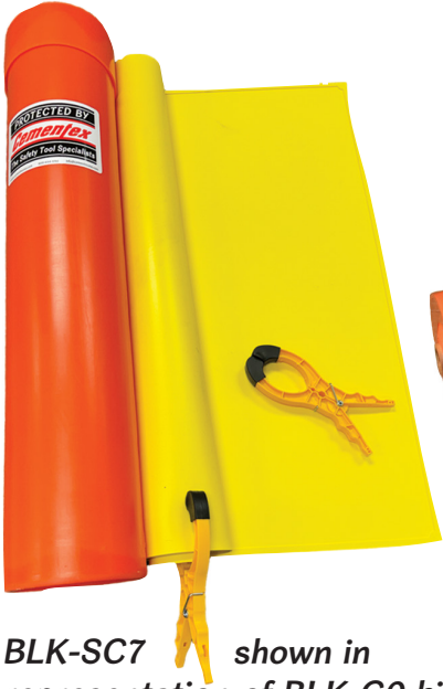
BLK-SC7 shown in representation of BLK-C0 kit