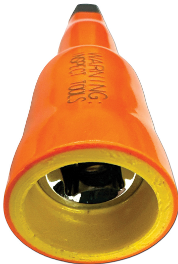
*Booted style hex bit socket