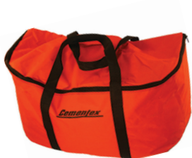
Standard Kit Duffel Bag