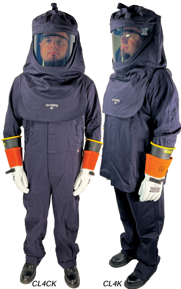
CL4CK CL4K *shown with class 2 glove option*