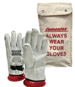
Optional Glove Kit *Class 0 shown*