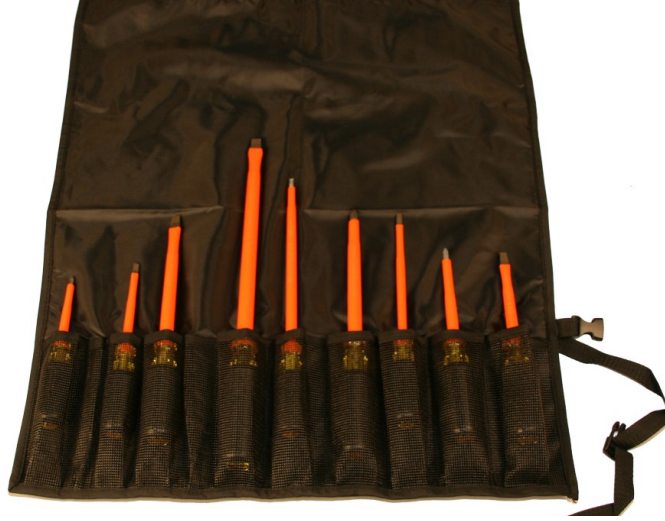
Image for illustrative purposes only— TR-9SD screwdriver roll pictured.