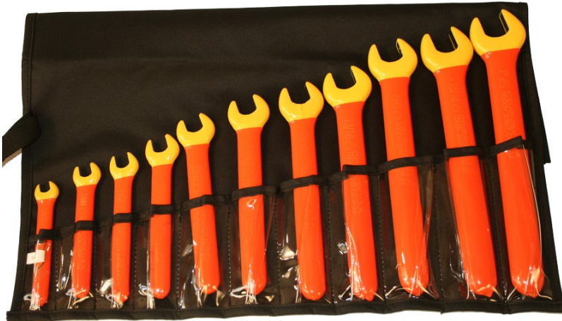
Photo is only meant to be representative of the IOEWS-17M kit.