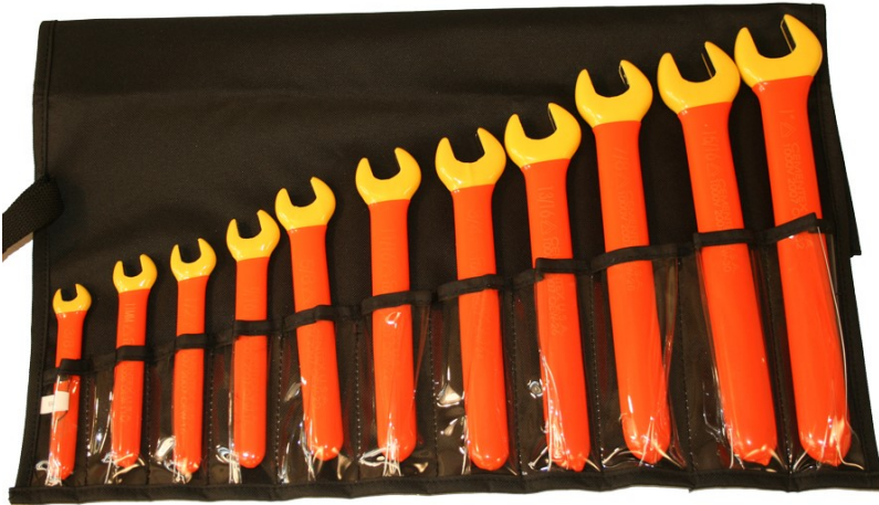
Photo is only meant to be representative of the IOEWS-13M kit.