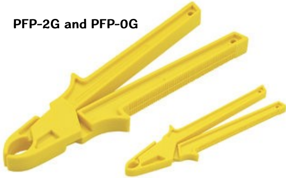
PFP-2G and PFP-0G