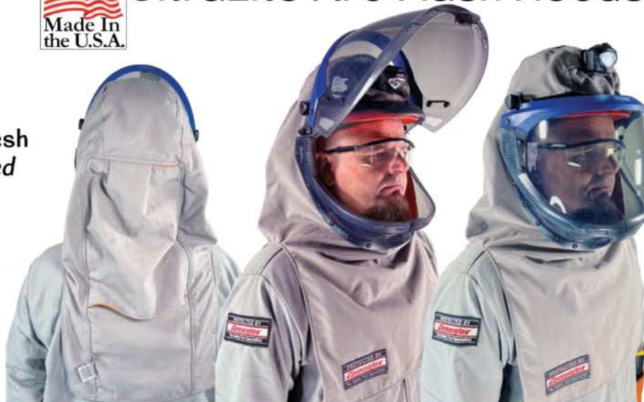
CUL40-AFH-LF-G WITH HOOD LIGHT (LIGHT-1)

Lift Front Hoods allow for quick and easy access to fresh air when outside of determined safety boundaries.