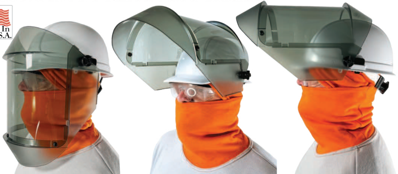
AFS-180 (shown with UVSG-42 and CUL11TBAL)