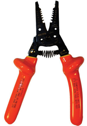
WS7C-1022 Strips and Cuts 12-22 AWG Stranded and 10-20 AWG Solid