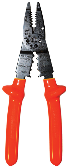
WS19 Strips and Cuts 10-22 AWG Solid or Stranded