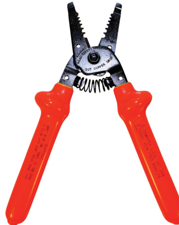
WS45-215 Strips and Cuts 10-20 AWG Solid or Stranded