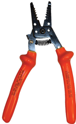
WS45-615 Strips and Cuts 10-18 AWG Stranded and 8-16 AWG Solid