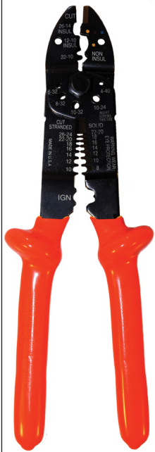
WS30-428 Strips and Cuts 10-26 AWG Stranded and 10-22 AWG Solid