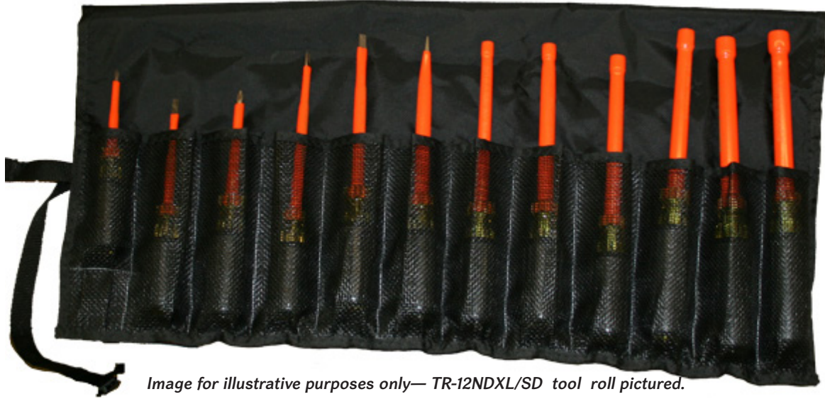
Image for illustrative purposes only— TR-12NDXL/SD tool roll pictured.