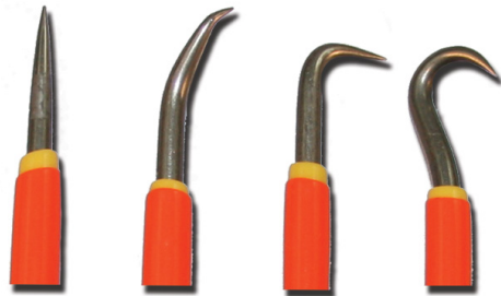
ISP-7 ICP-7 INP-7 IBP-7