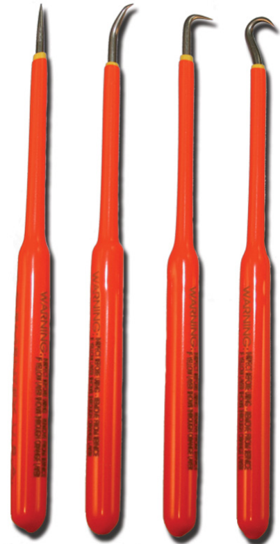
ISP-7 ICP-7 INP-7 IBP-7

Each hook and pick is made of high carbon polished steel in a permanently attached aluminum handle which is then double-insulated; tested to 10,000 Volts AC and rated for 1000 VAC / 1500 VDC protection.