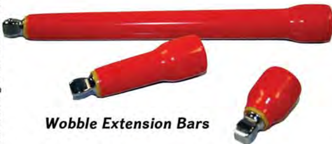
Wobble Extension Bars